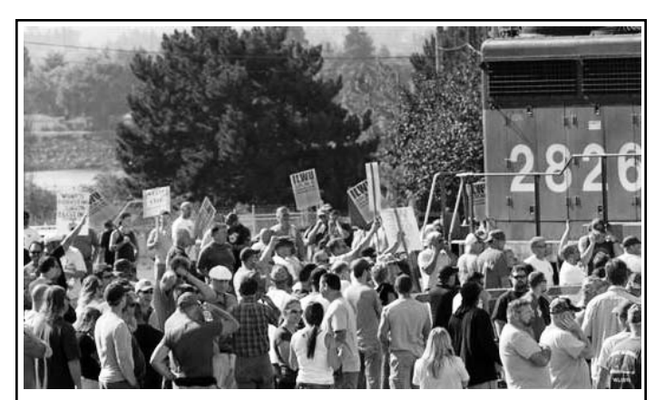
Longshore workers in the Pacific Northwest are determined to win their battle with multinational giant EGT. Here they swarm onto the tracks near the grain terminal in Longview, WA. They need and deserve the solidarity of every railroad worker in North America.

With the help of railroaders and other workers, these long-shoremen can win their fight. And some time down the road, when we are locked into battle with the rail carriers, the longshoremen will be there for us too. That time may be rapidly approaching, as the major carriers have failed to reach agreement with the unions and a number are now moving toward the prospects of "self-help". (See Page 1 and Page 3). So let's support our natural allies — the longshoremen — and get a little practice in on the picket line in the meantime.