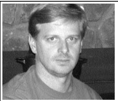
Railroad Workers United offers the unity we need to move forward again. All for one and one for all! To attend the Third Convention in Chicago is a landmark opportunity. Stand up and be counted."

More information will be forthcoming as the date gets closer. Watch the RWU website and list serve as well as future issues of The Highball for registration and room rates, registration forms, a tentative agenda, and a listing of workshops scheduled throughout the weekend.