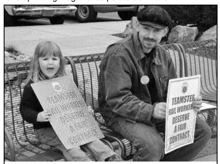
A Canadian railroad worker pickets with his daughter in Scagway in September 2011 in efforts to win a fair contract. What's next for railroaders in the U.S.?

Will it be different this time? That is up to rail workers, who like many other workers have increasingly had their fill of business-as-usual. Workers are on the move worldwide, all across Europe and North Africa. Public workers staged an impressive uprising in Wisconsin and other midwest states this past spring. Verizon workers in the east went on strike this summer, while Longshoremen are battling it out on the west coast (see Page 7). Citizens are "occupying" financial districts from coast-to-coast, identifying the banks, the wealthy and the corporations as the enemy of the rest of us, the "99%". (see Page 6). Rail workers may soon join the ranks of these insurgents and take up the fight against corporate domination.