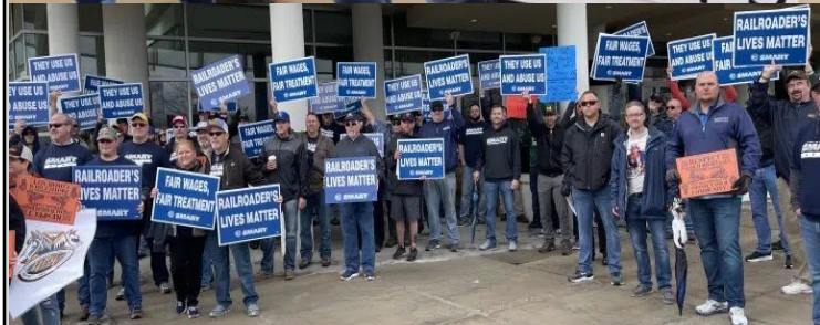
BNSF members of BLET & SMART-TD, and supporters, demand respect and quality of life on & off the job at Berkshire Hathaway annual shareholder meeting in Omaha, NE in April 2022.

We have seen a decline in safety as the numbers of accidents and derailments has climbed - this in spite of the fact that there are now 30% fewer workers to be hurt on the job, there are less trains plying the rails to derail, and less freight is being moved. To add insult to injury, the rail carriers launched a series of at-