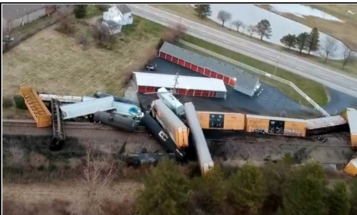
A month after the E. Palestine, OH derailment, 300 miles SE of there, 20 cars of a 212 car NS train derailed. Fortunately nothing hazardous was involved - THIS time.

Railroad Workers United urges all rail workers to get involved in this fight. We oppose any expansion of the current length and tonnage of existing trains; and we support a reduction in length and tonnage of already existing trains, especially those hauling hazardous materials, traversing steep grades, and /or that operate in cold temperatures. The time has come for the government to protect rail workers and communities and stop the madness.