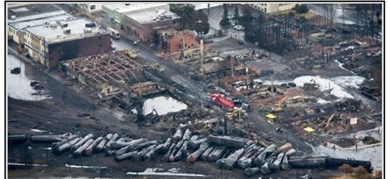
The aftermath of the preventable Lac-Mégantic derailment and explosion on July 6, 2013. Over 40 buildings were razed. 47 people perished, most of them incinerated alive in the ensuing inferno.

A major cause of the LM wreck was the deliberate decision to run an extra-long, dangerously overweight and overspeed (for the rating of the tank cars) train of one of the most volatile prod-