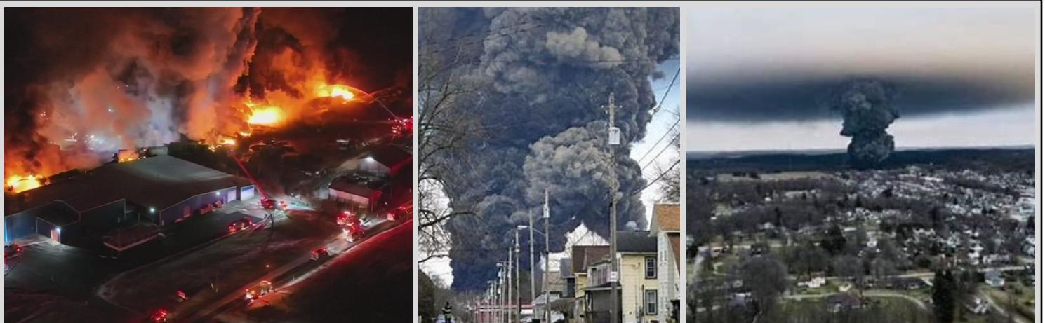
Left: The immediate aftermath of the Feb. 3 derailment in E. Palestine, Ohio, with emergency crews attempting to extinguish the raging fires. Center: Gigantic black plumes of toxic smoke fill the sky during the “controlled burn” on Feb. 6. Right: From a distance, the resulting mushroom cloud - which are normally associated with atomic blasts. The NTSB Chairwoman Jennifer Homendy asserted, “This was 100% preventable.”