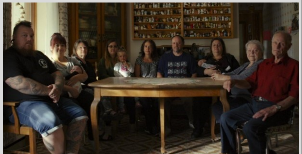
Family and friends of the victims, along with survivors of the Lac-Mégantic tragedy, gather to share their stories for the docuseries, "Lac-Mégantic: This Is Not an Accident." "It was extremely important to me to give a voice and a face to the people of Lac-Mégantic, who not only suffered a massive tragedy, but have been reliving the trauma over the past 10 years as the powers-that-be continue to make negligent decisions that affect their everyday lives," said Falardeau. RWU members will be joining rail safety and community activists, including a contingent from Lac-Mégantic, for the North American premiere in Toronto on Apr. 29. A capacity crowd of 250+ is expected and RWU will participate in the Q & A period.

Following its festival premieres, the French language version of the series begins streaming May 2 on VRAI, with other broadcast announcements to follow.