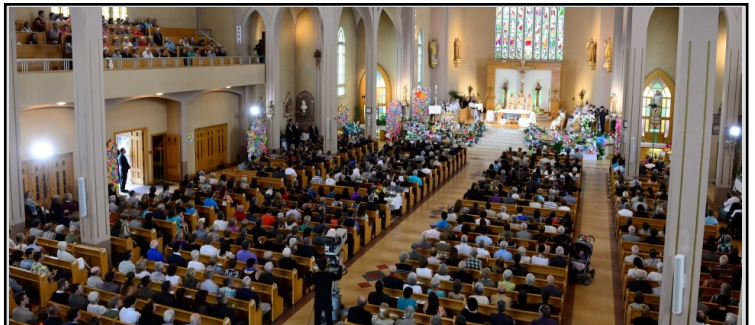
Over 1,000 mourners fill Ste. Agnes Church in Lac-Mégantic, Quebec, on July 27, 2013 - three weeks after the downtown was leveled by a runaway oil train that derailed and exploded - for the mass memorial to honor the 47 victims. Hundreds more participated outside, with the service broadcast on a big screen. After a failed attempt to scapegoat the engineer, no one has yet to be held accountable.