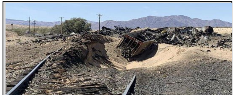
March 27, 55 cars and 2 engines of a 154 car, 21,600 ton iron ore train derailed descending a 2.2% grade near Kelso, CA. Preliminary reports suggest that once the dynamic brakes shut down due to a technical malfunction, the air brakes were insufficient to control the train, which then became a runaway. The crew apparently managed to jump

Somewhere in the middle of all of this mess and destruction, the Rail Safety Act of 2023 was introduced in the U.S. Senate by six Senators, three Democrat and three Republican. Both parties hope to claim the mantle of making the rails safe for workers and communities. Among other things, the bill ostensibly sets out to limit train length and weights, supposedly to prevent these sorts of wrecks from happening, or when they do, to mitigate against the havoc they tend to wreak. But the bill does not mention a single specific limit to length or weight, but rather, leaves that up to the Department of Transportation (DOT) to decide "within a year" of the bill's passage (and who knows which corporate lackey might be in charge of the agency at that time). Who knows what limits will be decided upon by this agency, riddled as it is by rail transportation and other transport managers, and subject to intense lobbying and bullying by the industry over the course of the coming year. And whoever is in charge, and whatever length and weight they determine to be "safe", what the DOT giveth, the DOT can taketh away.