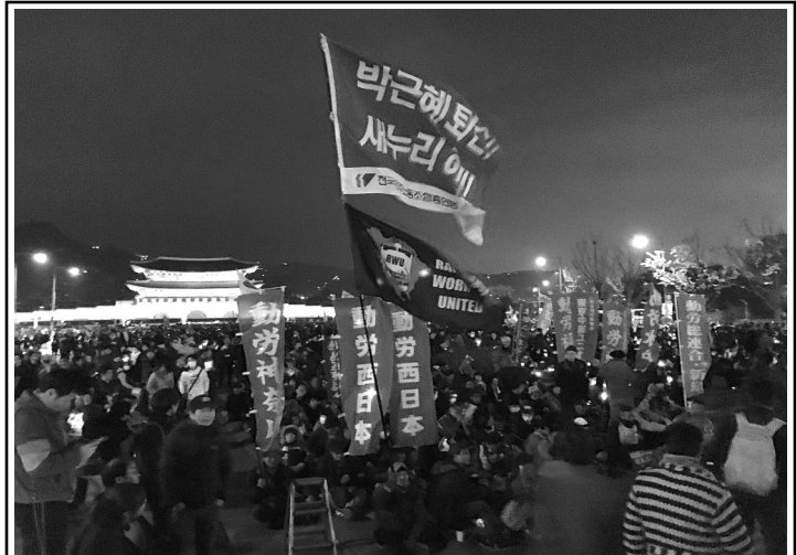
RWU members from the U.S. join Korean workers at a rally to bring down the anti-labor government in Seoul, South Korea. Note the Railroad Workers United flag flying in the center of the photo.