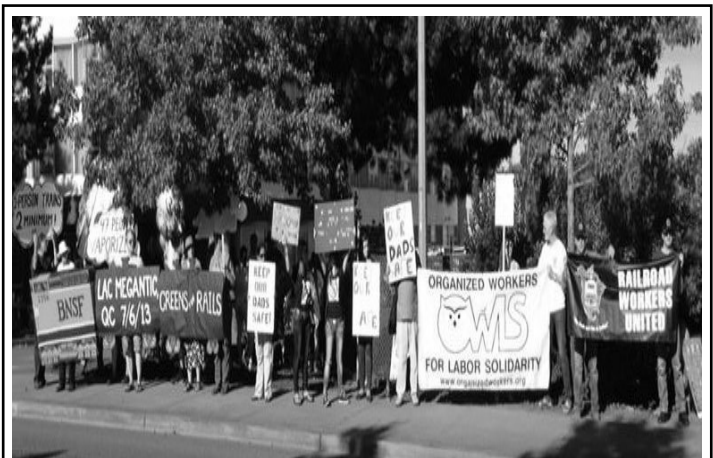
Railroad workers and their allies in the community picket against single employee crews in Seattle, August 2014. What can we accomplish with this emerging labor-community alliance?

As we know, the battle against single employee crews is far from over. The fight to defend our wages, benefits and working conditions knows no end. We need all the help we can get! Therefore, we must appreciate the nature of the system and broaden our horizons. Huge and powerful corporations – the big rail carriers in particular – wield great power and influence in society. They have allies in many places, and largely control both political parties, the courts and the media. To fight back we need numbers, the kind of numbers we simply no longer have in our unions. But the majority of the people are workers, and they live in the community right alongside of us. To win, we need them. And likewise, they need us. It's time for an alliance of labor, community and the environment!