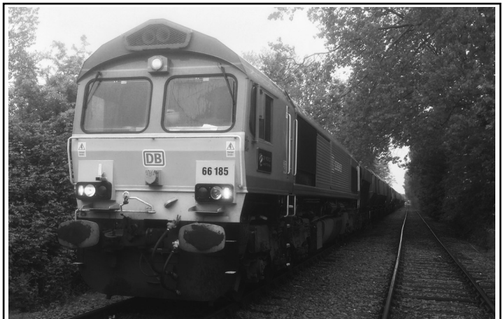
American built Class 66 locomotive #66185 on a train at Elstow Sidings (Bedfordshire) waiting to back out onto the mainline with 42 empty wagons after delivering 1500 tonnes of road stone.

hours is compulsory between turns of duty, and we can never work more than 13 consecutive days. These are some of the recommendations that were implemented after the Clapham Junction Rail Disaster in 1988 where 35 people were killed and 484 injured. A major contributing factor in this tragic incident was fatigue through working excessive hours. My maximum scheduled day is 11 hours 30 minutes with no driving after the 11th hour although I can drive up to 12 hours at my own discretion in the event of delay. A 10 hour maximum day is more common on passenger operations. Salaries vary by company, with the lowest paid drivers receiving around £40,000 (approx. $62,500) and the highest paid somewhere in the region of £57,000 (approx. $89,000) per year for their basic pay before overtime.