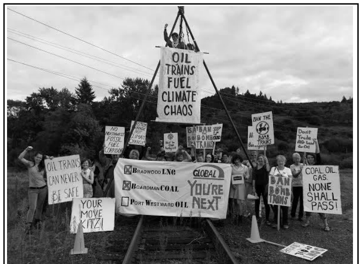
Public demonstration of outrage at the Global Partners Oil Terminal in Oregon in the Fall of 2014. Recent organizing efforts by citizens’ groups across North America may offer railroad workers a unique opportunity to tell our story and build new alliances to more effectively deal with the rail carriers.