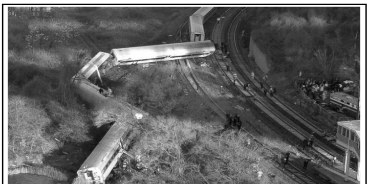
Can Metro North reform itself into a safe, law abiding railroad?

This is not the first time that OSHA has awarded a railroad worker punitive damages suffered by a law-breaking railroad company. In fact, OSHA has found every Class One rail carrier in the U.S. guilty of violating workers' rights to a safe workplace free from discrimination for reporting hazards and/or workplace injuries. And in every single case, the rail carrier has appealed the OSHA decision as a matter of course, in effect throwing out OSHA's finding and remanding the case to the courts. With such brash claims about the company's "zero tolerance for reprisals against workers" will Metro North have the unmitigated audacity to appeal this one? They have 30 days from the date of the ruling, December 16th. Stay tuned.