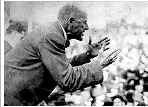
The railroad union Organizer and founder of the American Railway Union, the father of industrial unionism in the USA, Eugene V. Debs urges a crowd of workers to organize along industry lines more than a 100 years ago.

While this tissue-thin veneer of "unity" might have pleasant optics to the operating crafts, it was a vicious knife-in-the-back to the non-operating crafts who opposed the tentative agreement. Scandalously indifferent to these sentiments, the UTU and BLET leadership sold this to their members with, "There's no major work rule changes here so hurry up and ratify this before the bosses change their minds." This thought process is seriously flawed. Why would the bosses confront a major component of the work force in "national" bargaining when they're still licking their wounds from the hurt BNSF workers put on them with their attempted engineer-only agreement in 2014, and with the exception of the Wheeling & Lake Erie RR workers, they've had little to no opposition getting their coveted rule changes one terminal, property and/or carrier at a time (i.e. CN & CP)? Rather than risk another humiliating defeat, much less a possible uprising, they seem to be content with their piece-meal, path-of-less-resistance strategy for now.