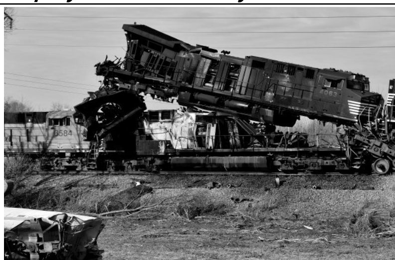
Norfolk Southern points the finger at two of its employees who it claims are solely responsible for the train wreck in Georgetown, KY on March 18th. Those who work on the railroad know that behind every train wreck there is a whole series of underlying factors, often hidden from view, and usually the result of failed corporate policies, practices and procedures.

The suit goes on to claim that the two men are liable for damages to the railway's property, including, but not limited to, damages to the locomotives, rail cars, tracks, right of way, communications and signal equipment, expenses related to getting the rail cars back on the track, transporting the locomotives for repair, and