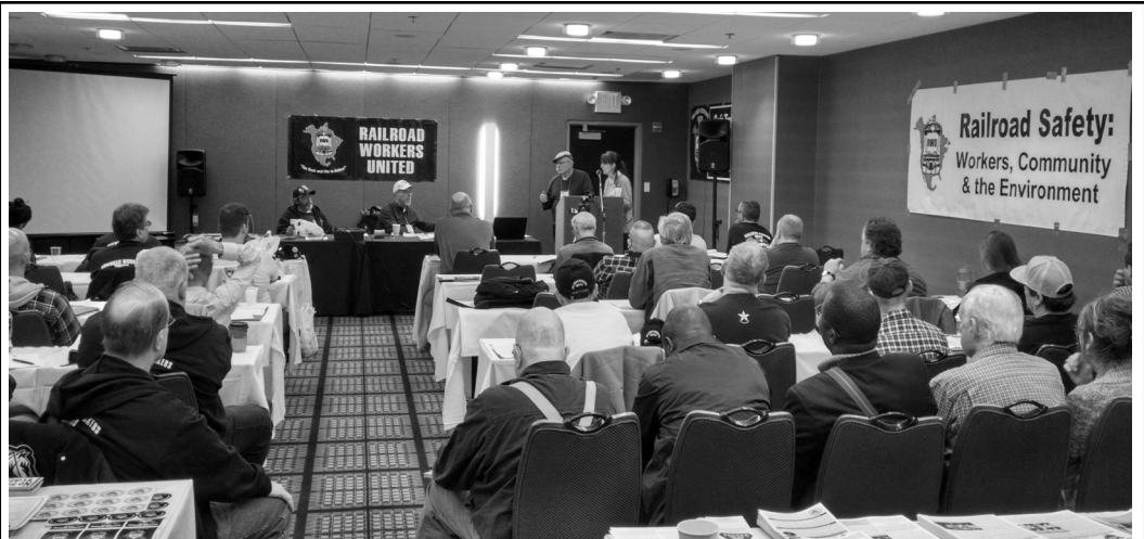
Railroad workers from across North America take part in the 6th biennial Convention of Railroad Workers United (RWU) in Chicago, IL on April 5th and 6th. Originally founded in Dearborn, MI in 2008, the organization celebrated its 10th anniversary this past April.

Near the close of the Convention, the new RWU International Steering Committee (ISC) was seated, which includes five new members. The new ISC and Trustees are composed of RWU members from 11 different states and six different unions. For a full listing of all ISC members, Executive Committee members and Trustees, see the RWU website.