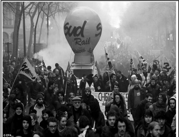
French railway workers of the union SUD - Rail march in Paris. The initials stand for Solidarity - Unity - Democracy. Coincidentally, this is the very same slogan used by Railroad Workers United.

But the workers and their unions have their work cut out for them. Not only are they diametrically opposed to the French President's vision of a "new" France, they are squaring off against the basic thrust of the European Union to open up the European rail system to private and international competition. If the French railroad workers lose this fight, there is every reason to believe that outright privatization - such as has taken place in the UK - could be the endgame. The result: longer