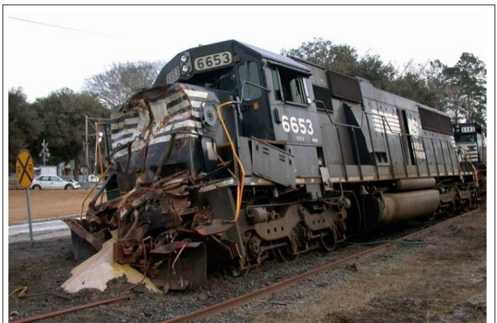
Lead locomotive in the aftermath of the NS wreck at Granite, SC in 2006 that killed nine. The NTSB recommendations for switch point indicators in dark territory went unheeded by the rail carriers and the FRA, as did a more modest proposal for restricted speed to avoid such collisions. In both cases, the railroads complained of the exorbitant expense of such installations or operations.

In conclusion, it is worthy to note that despite the billions spent on PTC over the last decade, the rail carriers have continued to rake in uninterrupted record profits and reduce their operating ratios to all-time lows. So, the next time you hear a railroad executive balk at NTSB recommendations as "too expensive" or "unnecessary" or a "hindrance to train operations" while the FRA turns a blind eye, don't believe a word they say. Rather, recall this past decade – the PTC mandate, the spate of catastrophic train wrecks and the record profits – as a reminder that, when it comes to making for safer train operations, the rail carriers have forfeited all moral authority to speak on the question.