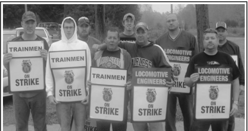
The upcoming RWU Rail Labor History Calendar for 2018 will include more than a dozen photographs of rail labor actions, both from the past and modern times, like that of engineers and trainmen pictured above, on strike in 2014 against Midwest regional rail carrier Wheeling & Lake Erie.

To order yours, see the RWU website or call 202-798-3327. For those interested in purchasing multiple copies for co-workers, friends and family members, big discounts are available on orders of more than five (5) copies. Help spread the word of our heroic history, and help to inspire rail workers' confidence to wage the battles that lie ahead.