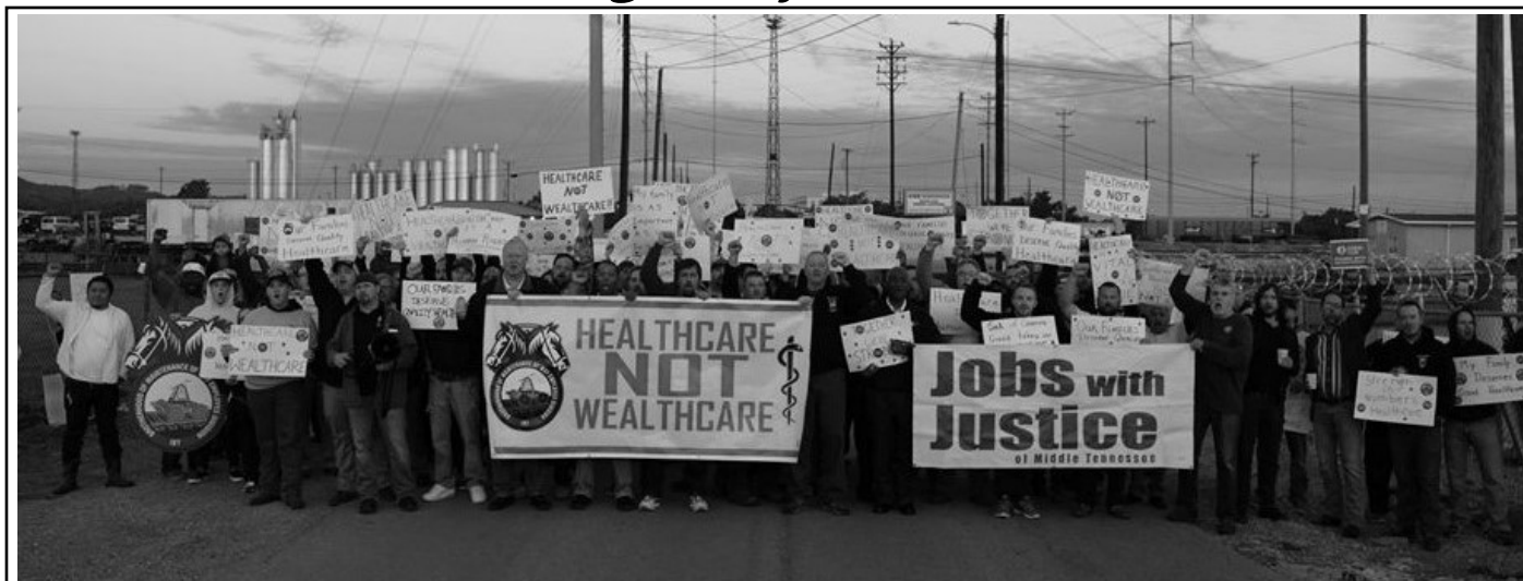
Railroad workers and allies rally in Nashville, one of three major terminals targeted by the union that spearheaded the "Day of Action" on May 3rd. The action was called to unite and mobilize all railroad workers in the U.S. to send a message to the rail carriers that rank and file rail workers demand a decent contract. For full article, see Page 3. For RWU's opinion, see the Editorial on Page 7.