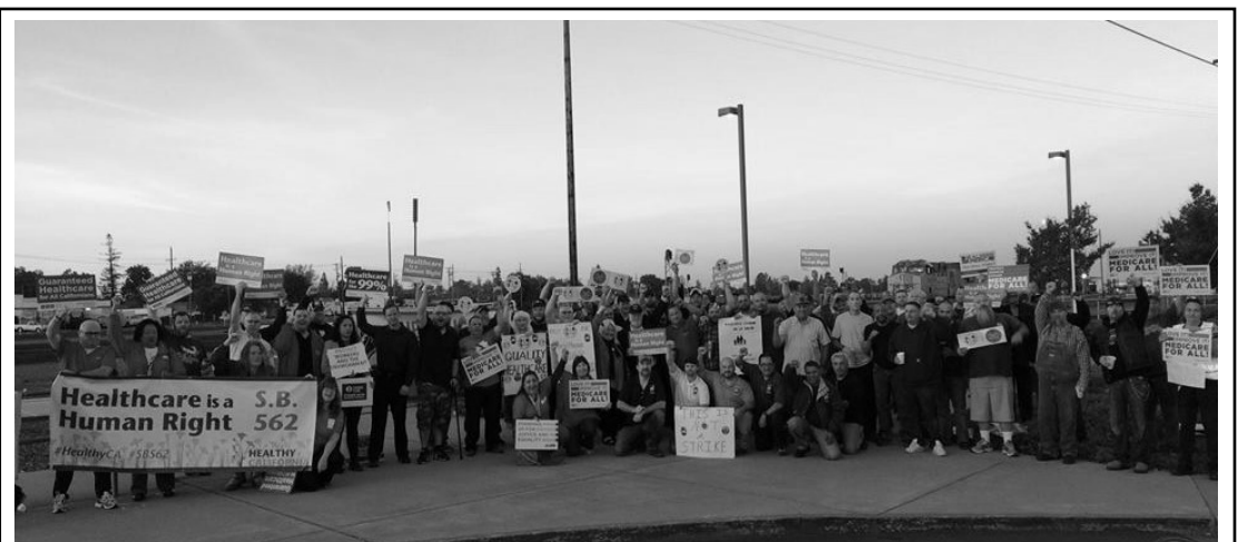
Railroad workers and allies rally at the big Union Pacific yard in Roseville, CA on May 3rd, one of three major terminals that the union sought to target around the U.S. in the effort to win a good contract.

We call upon all of rail labor and all union leaders to set aside union politics and sectarian divisions and join in solidarity. The combined power of the railroad carriers is far too great for any one union to defeat on its own. The track maintainers and the BMWED have pointed the way. It is time for other railroad workers to join in the fight and claim what is rightfully ours, together arm in arm. "An Injury to One is An Injury to All!"