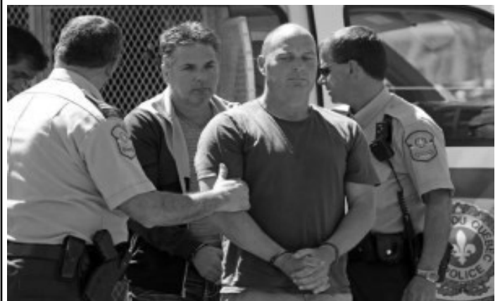
All those with an interest in safe train operations must support the dropping of charges against scapegoated railroad workers.

The trial of two railroad workers gets underway in September. If they are convicted, it will be a defeat for all railroad workers and deal a severe blow to the popular movement for safe trains. Convictions however will be a win for irresponsible corporations who put profits before safety, companies that cut corners and implement unsafe policies and procedures. The upcoming trial in Quebec is political. Are train wrecks the result of individual workers or corporate practices?