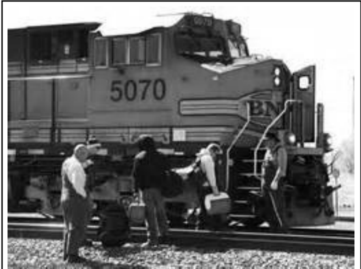
While the FRA's Proposed Rule on Train Crew Staffing takes some steps to regulate and limit single employee train crews, it does not outlaw them, it simply provides a roadmap that the rail carriers must follow in order to implement such operations. RWU is intent on stopping the carriers' desires to run trains with a lone employee. As a result, we urged comment critical of the Proposed Rule, calling on the FRA to strengthen the final rule to ban single employee train operations in most all situations.

time in the hope of dazzling the FRA with high-priced lawyers, experts and spokespersons. So this is just one arena in which the fight takes place. We are in fact winning victories at the legislative level, at the bargaining table and in the court of public opinion as well as here at the regulatory level.