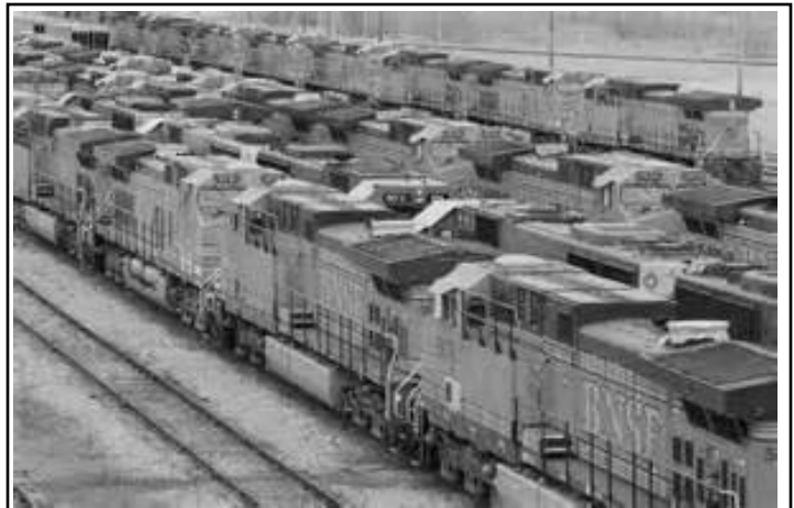
BNSF locomotives sit in storage in Seattle, WA. Class I railroads have stored hundreds of locomotives due to the downturn in freight traffic over the past year. In addition to causing numerous locomotives to be stored and company profits to plummet after decades of record setting numbers, thousands of employees have been furloughed and await to be recalled to service. Could the rail carriers have foreseen this trend and taken measures to avoid it?

While thousands of our fellow workers await to be recalled to service, we need to ask ourselves how to avoid such a calamity in the future. Was it not apparent that the downturn was at hand? And if so, what could and should our unions have demanded of the rail carriers to keep our people working? Are fossil fuel shipments a thing of the past? And if so, is it time for the railroad to take the necessary measures to lure back decades of lost shippers, attract new/old forms of freight like mail, perishables and express, and cooperate with public agencies to run passenger trains in select corridors? It is time for us to take a long-term perspective on the rail industry.