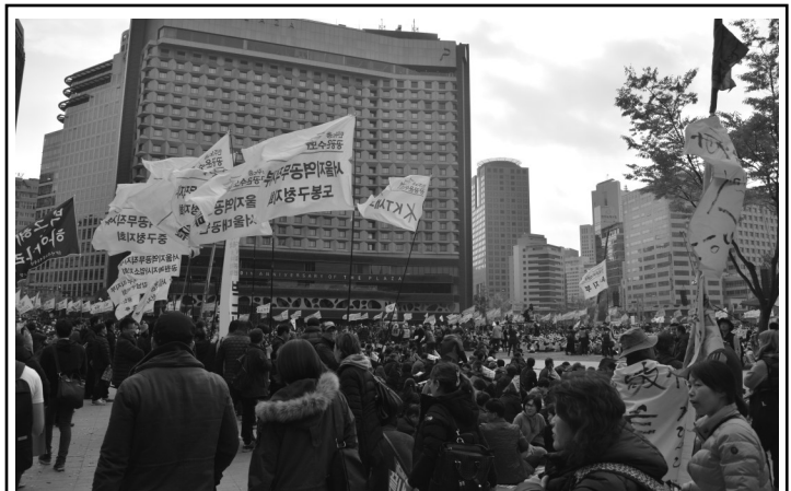
In November 2016, workers rally against the President at an event sponsored by the Korean Confederation of Trade Unions. Can their heroic political efforts be successfully emulated in North America?

Neither the Democrats nor the Republicans nor any other political parties are going to save us - the responsibility is on us as unionists to fight for our interests. The initial strikes and demonstrations led by union workers in South Korea grew into a huge movement that brought down a horribly corrupt, anti-labor president. This is an excellent illustration of how working people can exercise real political power in addition to voting, calling their congressional representatives, or donating to their union political action committee. We can defeat right-to-work , but only if we're willing to make the effort that was ultimately necessary to create our unions in the first place - organize, build solidarity, and fight for what we know is right.