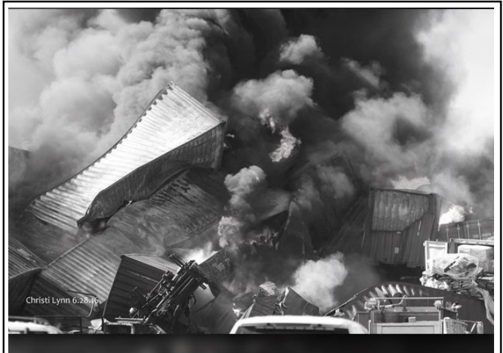
Train wrecks, both minor and cataclysmic, like the one depicted above on June 28th in Texas which killed three crew members are the result of numerous and complex factors. While the rail carriers deny the existence of crew fatigue, railroad workers know the truth. Unless and until remedies are implemented to solve the problem, we can expect further death and destruction.

The solution may cost the railroads more money. The railroads are betting that with the installation of PTC they may have an extremely high entry fee, but they will eliminate the costs of labor, which they are betting will offset and exceed these initial ‘entry’ fees. Because these systems are so complicated, I’m not sure that is a good bet ... but they are well on their way down this avenue. Railroads have traditionally done all they can to eliminate costs while ignoring the issues that create those costs. For example, crews once got ITD (initial terminal delay) and FTD (final terminal delay). When