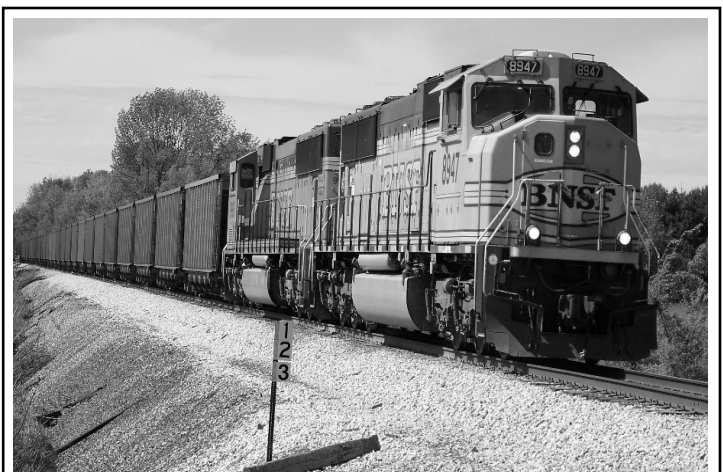
Coal has long been the backbone of the rail industry. But alternative energy forms are now on the rise. With coal's demise, how do we as railroad workers best defend and secure our futures?