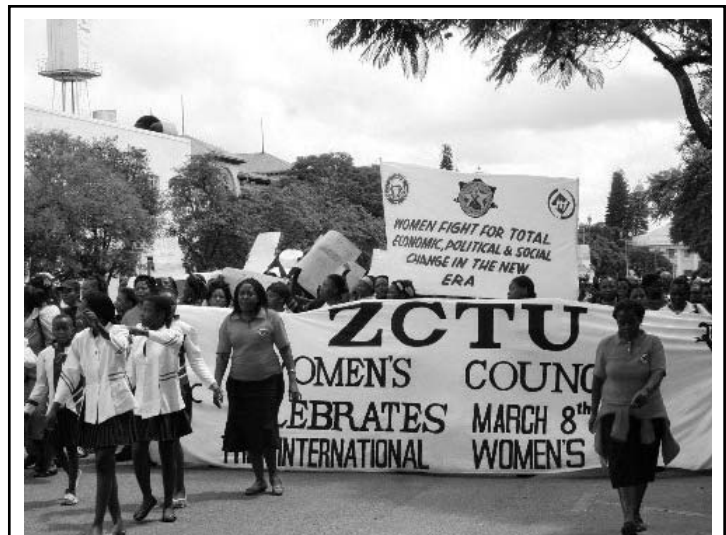
Women workers march when trade unions in Zimbabwe celebrated International Women's Day in March 2010

The International Women's Day campaign is part of a wider umbrella campaign by the International Trade Union Confederation, who on March 8th, 2008 launched a global campaign for decent work and decent life for women.