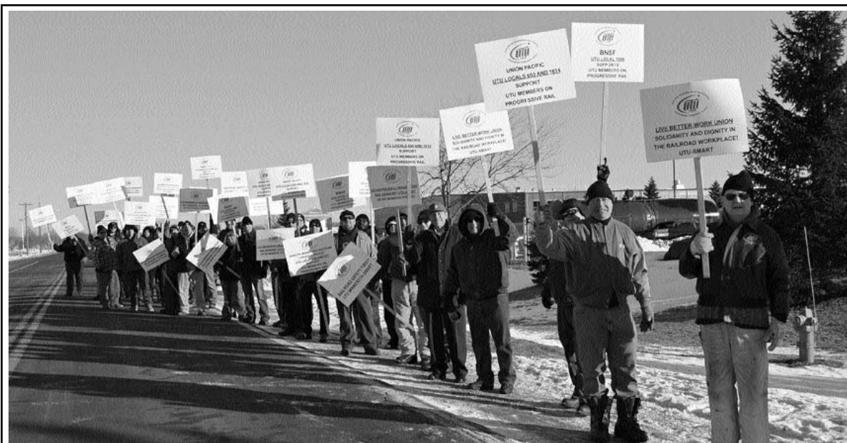
Railroad workers in the Twin Cities picket against the union busting tactics of shortline Progressive Rail at the company's headquarters. Unions like the UTU and the BLET need to use creative and militant tactics to bring anti-union shortline railroads to heel. Recent decades have witnessed countless "spinoffs" which often are simply a way for operations to continue as non-union outfits.