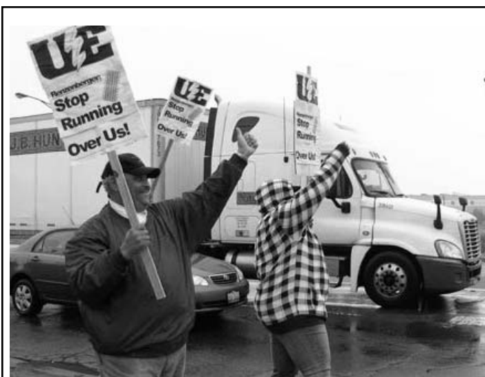
Crew van drivers protest Renzenberger at an earlier picket in Chicago to demand paid sick days and adequate rest.