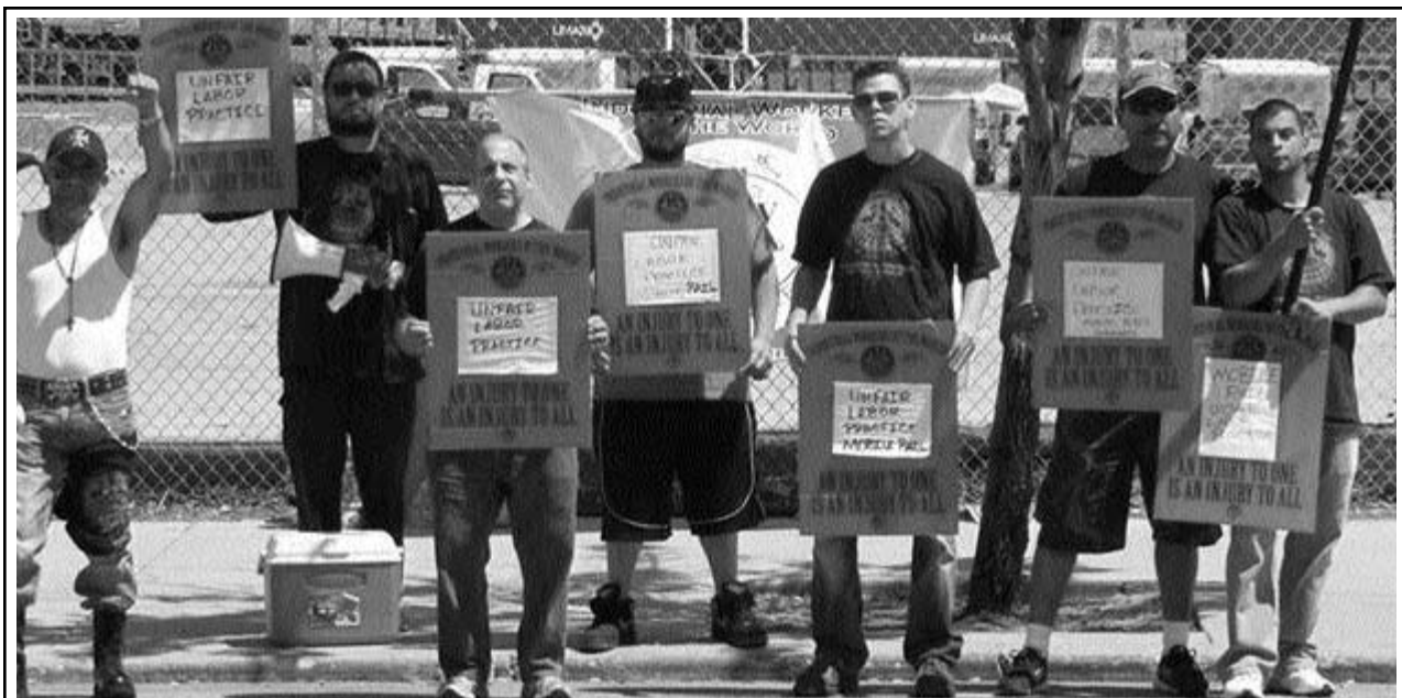
Locomotive service workers employed by MRS picket a rail yard in Chicago, IL. Their fight is our fight!

It is in the interest of every railroad worker to stand should to shoulder with the MRS diesel servicing workers, the Renzenberger crew van drivers, and others who are standing up and fighting back. And if you don't think that is your concern, you need to think again. Go on down and join them on the picket line, at rallies and demonstrations. Contribute to their strike fund. Honk your horn, give 'em the thumbs up, let 'em know you support their efforts. And please, honor their picket lines and DO NOT CROSS. The next job that your employer may decide to contract out may be yours!