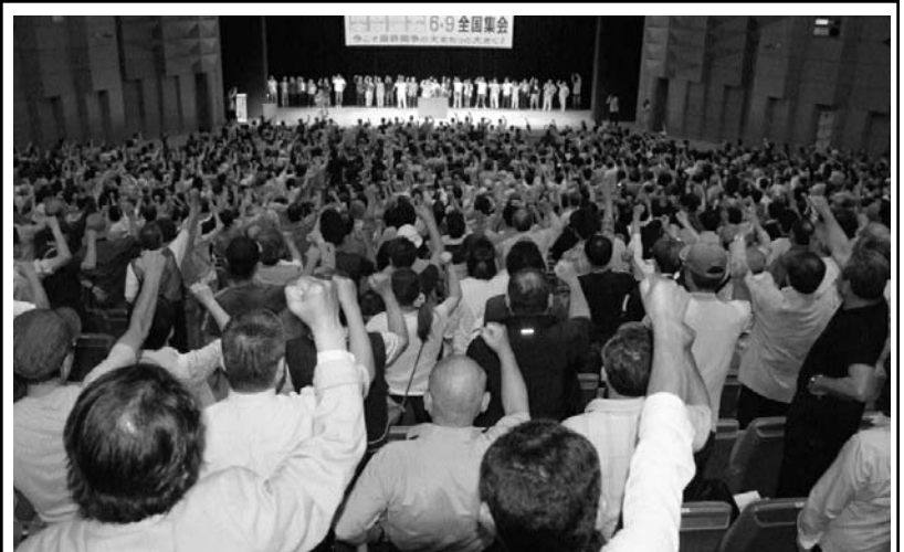
Railway workers and their supporters rally at the national action on June 9th, 2013. Doro Chiba, the Motive Power Union of Japan has been waging a protracted struggle since 1992 after the Japan Railways was privatized and thousands lost their jobs.

The Japanese working class as a whole is fighting proposals for mass austerity, that include turning 90% of the existing workforce into casual labor, together with complete dismantlement of healthcare, education, pension and the social security system.