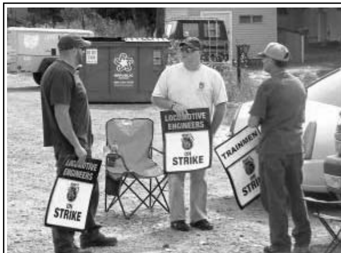
W&LE engineers & trainmen picket together in Ohio. RWU sees this strike as a major development in the struggle against single employee train crews, and urges all of rail labor to stand behind these brothers and sisters. Their fight is our fight!

We urge all railroad workers to pay particular attention and support this effort. RWU has adopted a resolution of support and has pledged to do all it can to win this fight. To see the resolution and learn more about our efforts, please see the website: www.railroadworkersunited.org .