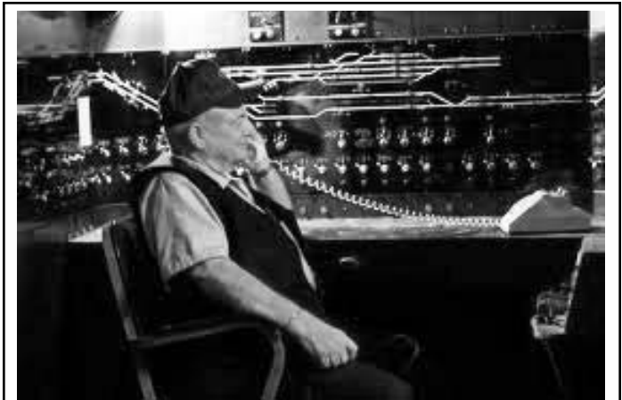
A train dispatcher from a previous era works a CTC panel. Today, the train dispatcher's job is more complex and demanding than ever. Unionization is the best hope these workers have to secure better wages, benefits and working conditions. Those at UP have been fighting to do just that this Fall, and hope to join with the other Class 1 dispatchers in the union as soon as they get the chance.

Get all the news about the struggle to win union certification at their facebook and twitter pages (UP Dispatchers - Club 151) and their blog Trainsheet.blogspot.com .